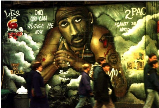
Tupac Shakur memorial mural in Manhattan's Lower East Side eLibrary