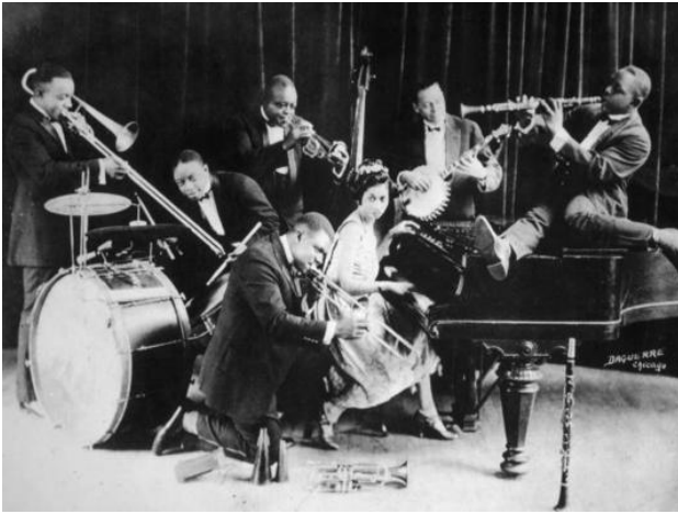
King Oliver's Creole Jazz Band with Louis Armstrong on trumpet

series of classic jazz recordings with his groups the Hot Fives and Hot Sevens, and would go on to become a world icon.