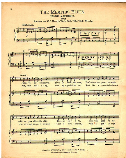
W. C. Handy's "The Memphis Blues"

The blues came, at least partly, out of the songs slaves sung, out of field hollers and what W.E.B. DuBois termed the "Sorrow Songs." In the late 19 th and early 20 th centuries, these coalesced into the quintessential African American music: "blues songs seem to turn up everywhere in the Deep South more or less simultaneously—in rural areas, small towns, and cities such as New Orleans and Memphis" (Evans 79). Often the blues were sung by a single individual, accompanying himself on a guitar. Love, sex, betrayal, poverty, drinking, bad luck, and an itinerant lifestyle are its themes.