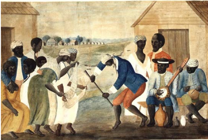
The Old Plantation , unknown artist, 1700s

Jes Grew spreads through America following a strange course. Pine Bluff and Magnolia Arkansas are hit; Natchez, Meridian and Greenwood Mississippi report cases. Sporadic outbreaks occur in Nashville and Knoxville Tennessee as well as St. Louis where the bumping and grinding cause the Gov to call up the Guard. A mighty influence, Jes Grew infects all that it touches.