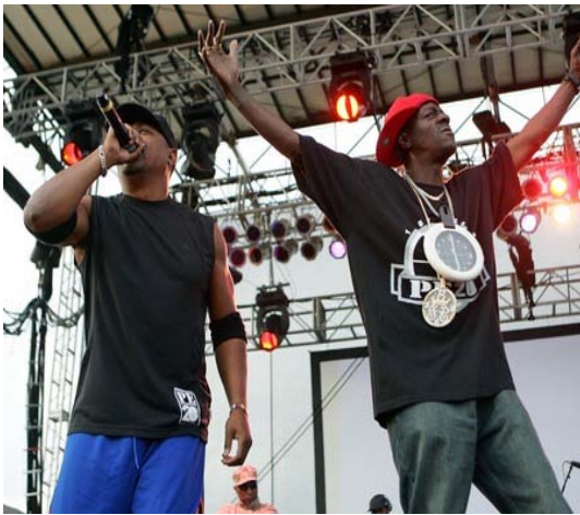
Public Enemy eLibrary

James McBride describes the reaction of those used to older schools of music as rap became dominant: “I realize to my horror that rap--music seemingly without melody, sensibility, instruments, verse, or harmony, music with no beginning, end, or middle, music that doesn't even seem to be music--rules the world.” Once again what had seemed a strange abomination grew and spread.