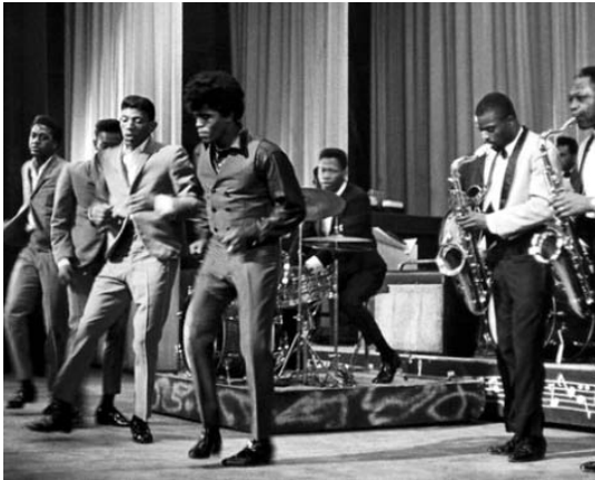
James Brown at the Apollo Theatre in 1960

Through the late 1960s and 1970s, soul moved to songs of political awareness and protest. Oddly, particularly considering its positioning at the height of the Civil Rights era, soul did not cross over to white artists as much as many other African American musical styles. Perhaps this is because many of the rock and roll artists in the late 1960s remained heavily influenced by blues.