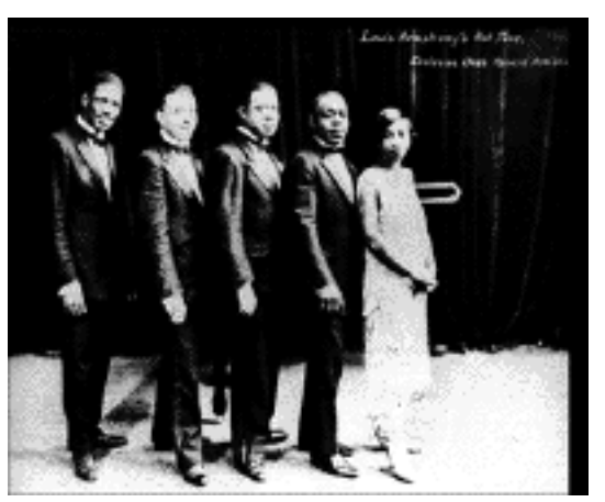
Louis Armstrong's Hot Five

This was a period of flux for the nation as a whole. WW1 would push the nation into the "modern era", new technologies were emerging - radio, talking pictures, records, and the migration from south to north (of which the New Orleans musicians were only a part) was changing the demographics of the country. With the advent of the '20's, a period of economic prosperity and changing social structure was slowly remaking the face of the United States. In my mind we were evolving from a regional outlook into a national one - not overnight but slowly and steadily aided by the radio, the talking picture, the record player, and the increased ease of transportation. F. Scott Fitzgerald gave the name to this era - the Jazz Age...more a statement of attitude than music.