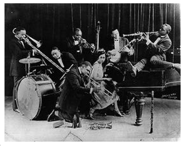
King Oliver's Creole Jazz Band

This music was evolving to adapt to different circumstances and environments. With the closing of Storyville by the Navy in 1917, the music on New Orleans fanned out across the country - not just 'up the river' to Chicago. It spread to any location that had work opportunities and transportation - Kansas City and New York. But it was Chicago which provided the easiest