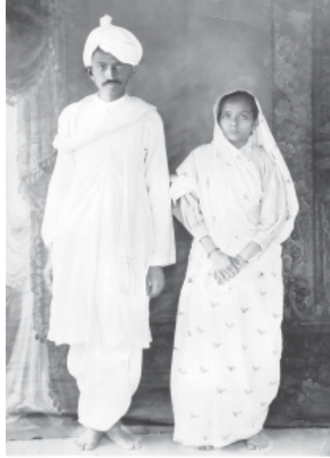
Arrival in India after successful Satyagraha

was a pleasure to feel free from the responsibility of raising funds.