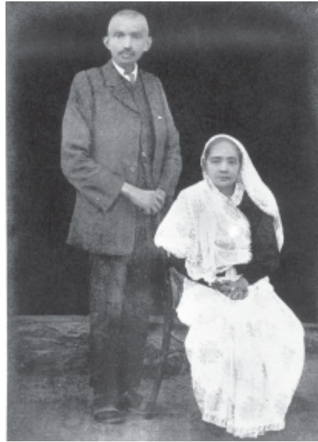
Gandhiji and Kasturba : In South Africa, 1913

I entered into correspondence with General Smuts over the work of the commission and came to agreement. The commission in its report recommended acceptance of the demands of the Indian community; and within a short time after the issue of the report, the Government published in the official Gazette of the Union the Indians' Relief Bill which abolished the £ 3 tax, made legal all marriages deemed legal in India, and made a domicile certificate bearing the holder's thumb-print sufficient evi-