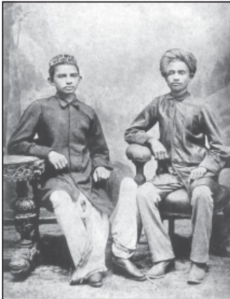
With a friend

I was surprised and pained. I asked my friend the reason and he explained it thus: "We are a weak people because we do not eat meat. The English are able to rule over us, because they are meat-eaters. You know how hardy I am, and how great a runner too. It is because I am a meat-eater. Meat-