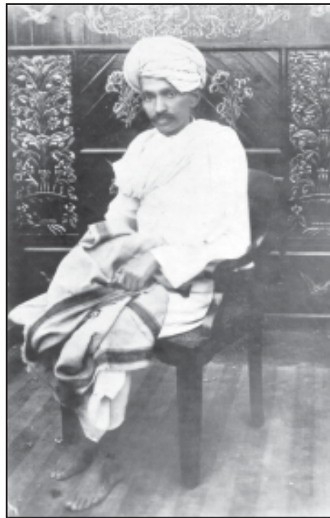
Kheda Satyagraha : 1918