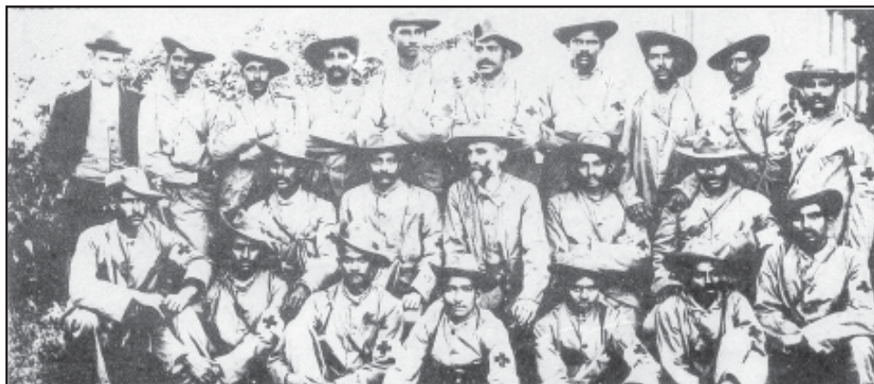
In the Uniform of a leader of the Indian Ambulance Corps

Our humble work was at the moment much praised, and the Indians' prestige was enhanced.