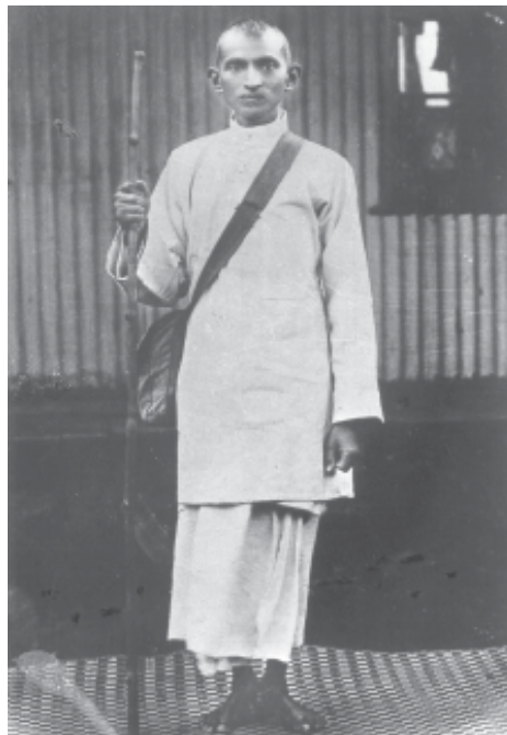
A Satyagrahi in South Africa

The next day there was held a small meeting of the leading Indians to whom I explained the Ordinance word by word. It shocked them as it had shocked me. All present realized the seriousness of