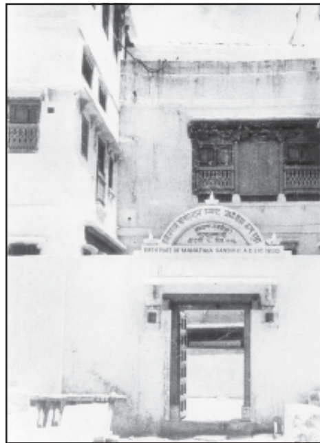
The house at Porbandar

prayers. Going to Haveli – the Vaishnava temple – was one of her daily duties. As far as my memory can go back, I do not remember her having ever missed the Chaturmas . She would take the hardest vows and keep them whatever happened. Illness was no excuse for relaxing them. I can recall her once falling ill when she was